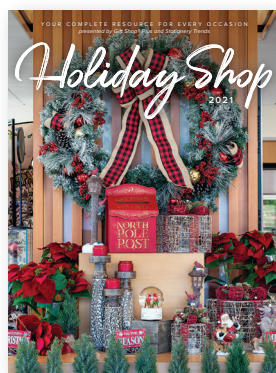
HOLIDAY SHOP June 2022