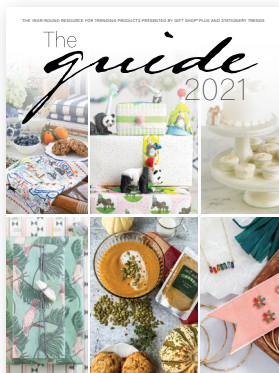
THE GUIDE March 2022