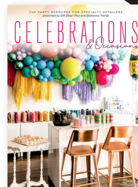
CELEBRATIONS & OCCASIONS November 2022

SIGN UP TO RECEIVE THESE SPECIAL ISSUES AS SOON AS THEY ARE RELEASED: STATIONERYTRENDS.COM/SUBSCRIBERS .