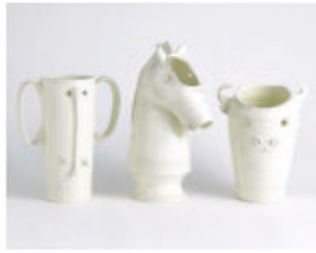
Global Views' hand-formed, hand-cut Italian vases are dipped in an antique white glaze. B1 14-C15