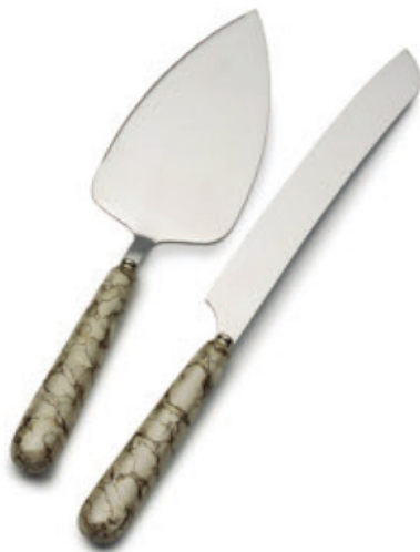
International Silver's Westwind Collection features ceramic handles with a faux marble look. B2 9-916

Marbling effects, patterns meant to resemble organic materials, marble and more marble, floral motifs and mixing collections.