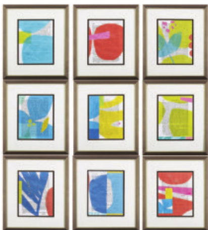
Propac Images' Wabi Sabi is a colorful set of nine abstract images that have been double-matted and framed under glass in a metallic bronze molding. BA 12-A2