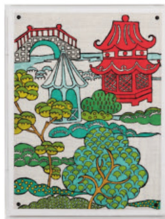
Port 68's Pagoda Landscape I and II is a colorful interpretation of an Asian countryside mounted under a Lucite shadowbox frame with nailhead studs in each corner. B1 14-E22

Artist + designer Jill Seale's marbling demonstration Saturday, July 17th, 10 a.m.-12 p.m. in the Port 68 showroom (B1 12-E22). Create your own art + take a peak as Jill's silk scarves under shadow box frames, as well as cash + carry original scarves and Jill's new resort line of dresses.