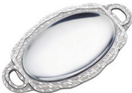
Inspired by the look of wicker or rattan, Wilton Armetale's Sweetgrass Collection is made of an aluminum-based alloy metal that is 100% recycled and food-safe. B2 8-891A