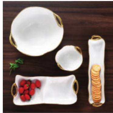
Pampa Bay's Golden Handles Collection features gold-finished handles and edges with gleaming white porcelain bodies. B2 12-1200