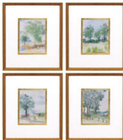
'Along the Way II S/4' by Liz Jardine for Paragon is a hand-embellished giclée with gold-leaf matting and framed in a 3/4" antique gold wood molding with an embossed weave pattern. B1 12-A8