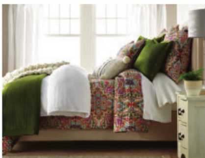
Amity Home's Christelle's Lemongrass quilt is sleek yet playful with its color. B1 9-A21

Accessories that pack a punch of color, stackable items, images of faces, accessories in sets of three, emerald green, and classic blue and white color combos.