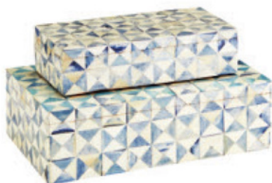
Currey & Company's Sky Blue features blue and white mosaic tiles meticulously arranged; sold in a boxed set of two. B1 1-L3