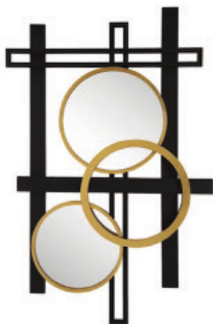
Uttermost's Urban Views mirror is finished in matte black and antique gold with geometric designs. B1 12-E2A

Wall décor displayed in a series (think gallery walls), colors that add personality, shadow boxes, bronze or gold molding, and mirrors that combine shapes that make you do a double take.