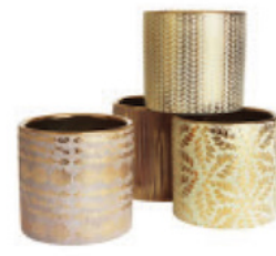
Napa Home & Garden's Safi pots are made of ceramic with a warm rubbed metallic pattern. B2 10-1010