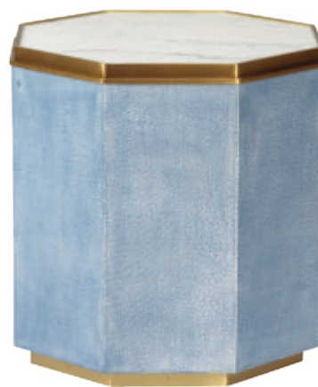
Chelsea House's octagonal cocktail table is wrapped in blue grasscloth and banded with antique brass; designed by Bradshaw Orrell. B1 14-E5