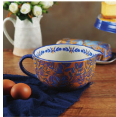
Fitz & Floyd's measuring cup, seen in the Madeline pattern, is made from clay stoneware. B2 8-891A