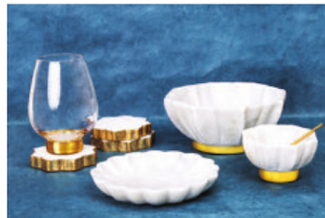
Godinger's Banyan Collection showcases the beauty of marble carving as each marble piece comes from the same quarry used to construct the Taj Mahal. B2 8-852