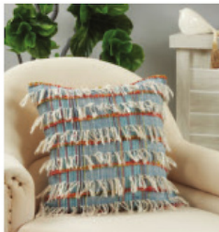
Saro Lifestyle's pillow includes a medley of colors with white fringe. B1 9-D12