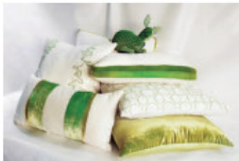
Kevin O'Brien Studio's Grass pillows feature colorful velvet made in Philadelphia. B1 9-C6