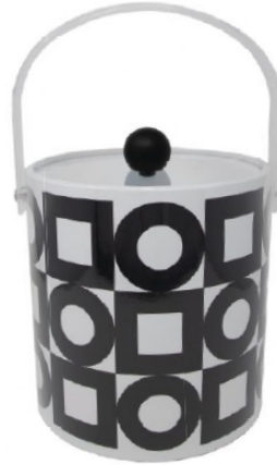
The Modernista ice bucket from Destination PSP is a minimalist/futurist pattern of circles and squares that is reminiscent of late 1960s designs. The bucket measures approximately 8 inches high and 8 inches in diameter. B3 2-1724 www.destinationpsp.com