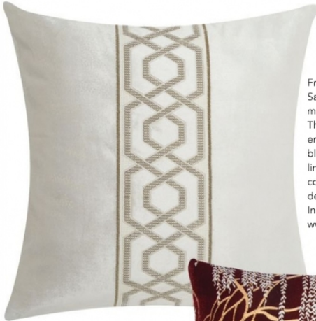
From Creative Threads, the Sarafina Birch velvet pillow measures 22 by 22 inches. The company offers unique embroideries and hand block prints available on silk, linen, linen cotton blend, cotton and burlap fabrics designed and crafted in India. B1 9-A19 www.creativethreadsusa.com