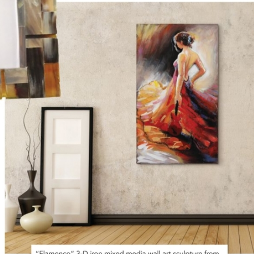
"Flamenco" 3-D iron mixed media wall art sculpture from Empire Art Direct is hand assembled and hand painted, by PRIMO artist. Measures 48 inches high by 28 inches wide. B1 11-E11 www.empireartdirect.com