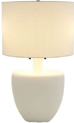
From Studio A Home, the Impression lamp is a slip-molded Portuguese ceramic lamp in matte white finish. Custom wired with "S" cluster socket with two chain pulls. B1 14-C1 www.studioahome.com