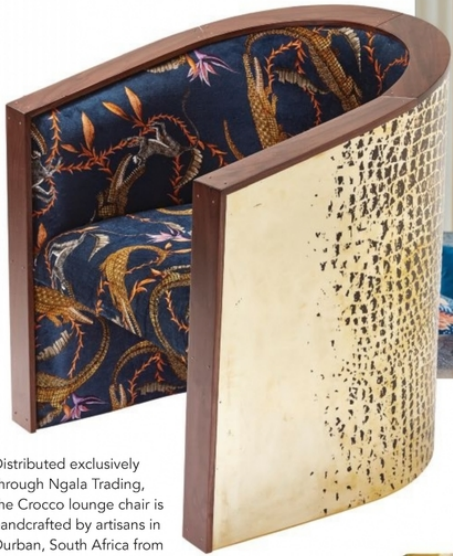
Distributed exclusively through Ngala Trading, the Crocco lounge chair is handcrafted by artisans in Durban, South Africa from walnut and solid etched brass. Available in six colorways of Zambezi velvet fabric and a variety of leather color options. B1 9-D4 www.ngalatrading.com