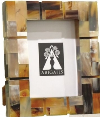
From Abigails, this bone inlaid frame features an attractive brown and black geometric design. The 8-by-10-inch frame adapts easily to both casual and formal photos. B1 15-A8 www.abigails.net