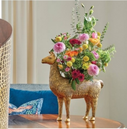
Wildwood's Llama Drama planter will greet guests with its whimsical charm. Perfect for adding fresh flowers, a favorite succulent or a trailing vine. B1 14-E7 www.wildwoodhome.com