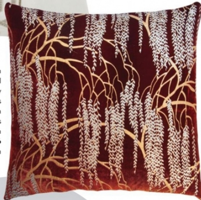
This foliage pattern, both whimsical and elegant, will add an elegant touch to any room. Kevin O'Brien Studio's metallic pigment prints add a new dimension to their lustrous velvets. Zip closure; comes with a feather/down insert. B1 9-C6 www.kevinobrienstudio.com