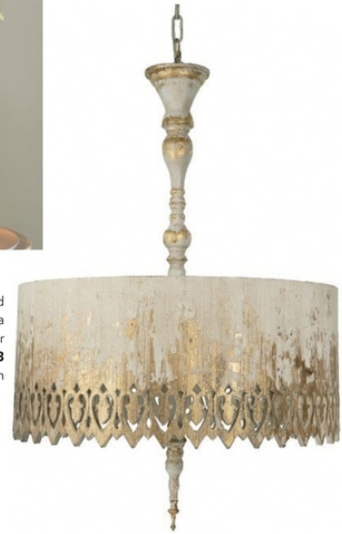
From Provence Home Decor, this distressed cream and gold metal pendant light has a carved rood shade. Fixture includes four sockets for standard 60 watt bulbs. B1 10-D8 www.provencehomedecor.com