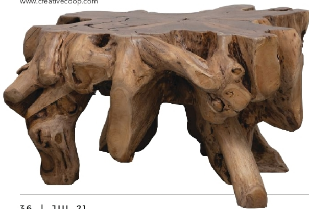
The beauty of nature is preserved in this coffee table from Creative Co-op. The raw teak roots are dug then finished in their natural state for a one of a kind table. The natural clusters of holes and crevices deliver a breezy style to the home. B2 10-1080 www.creativecoop.com