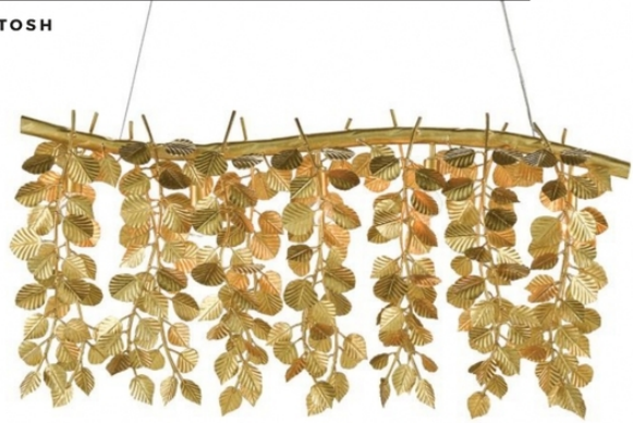
The Golden Eucalyptus rectangular chandelier in the Aviva Stanoff Collection for Currey & Company is a nature-inspired gold chandelier made from metal in a contemporary gold leaf finish. Also offered as a wall sconce. B1 1-L3 www.curreyandcompany.com