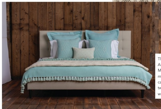
The Sydney blanket from Alicia Adams Alpaca is available in a variety of colors. Made of Alpaca wool, these double sided medium-weight pom-pom throw blankets can be flipped to show off either of their two complimentary colors. B1 9-D8 www.aliciadamsalpaca.com