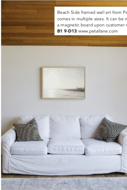
Beach Side framed wall art from Petal Lane comes in multiple sizes. It can be made as a magnetic board upon customer request. B1 9-D13 www.petalane.com