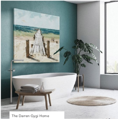
The Darren Gygi Home Collection line of made-in-the-USA artwork owned and produced exclusively by Sullivans will release four new nautical landscapes. The prints are available in five square sizes and are reproduced on canvas and gallery-wrapped around solid wood. B1 18-A1 www.sullivangift.com