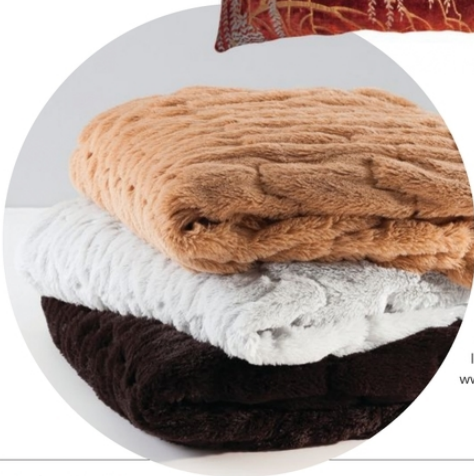
Made from the softest and coziest polyester, Peking Handicraft's Laurel & Mayfair faux fur throws feature a subtle texture and easy to coordinate colors make this a piece that looks just as good as it feels. Available in Camel, Chocolate and Ice Silver. B1 10-A4 www.pekinghandicraft.com