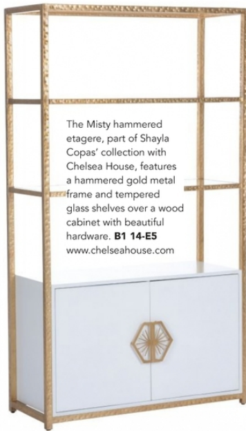
The Misty hammered etagere, part of Shayla Copas' collection with Chelsea House, features a hammered gold metal frame and tempered glass shelves over a wood cabinet with beautiful hardware. B1 14-E5 www.chelseahouse.com