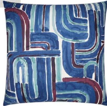
From D.V. KAP Home, the Bender pillow in Navy features a bold watercolor like print on a basket weave base cloth. B1 15-E3 www.dvkap.com